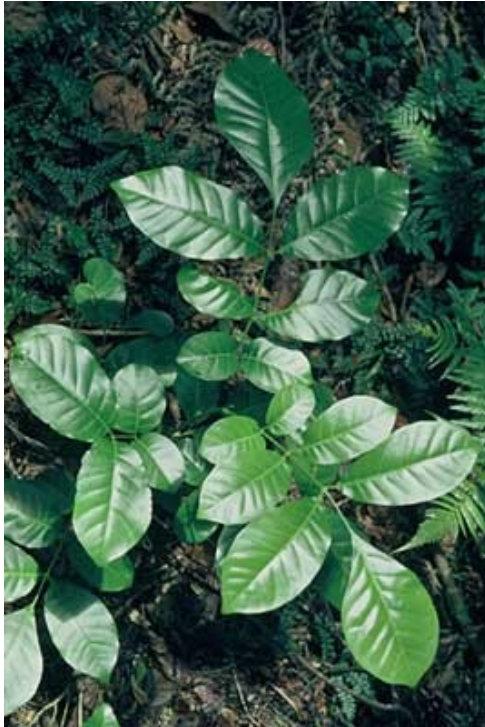
Dysoxylum spectabile, kohekohe