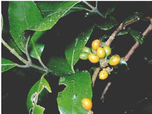
Hedycarya arborea, pigeonwood - fruit