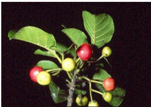
Vitex lucens, puriri - fruit